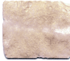
Pericardium and Fascia Lata

Natural biocompatible resorbable membranes such as Pericardium and Fascia Lata are known for their ease of handling and protective capabilities. Membranes inhibit epithelial down growth and infiltration of connective tissue fibroblasts. Excellent for GTR & GBR procedures. Coforms to the graft site without memory.